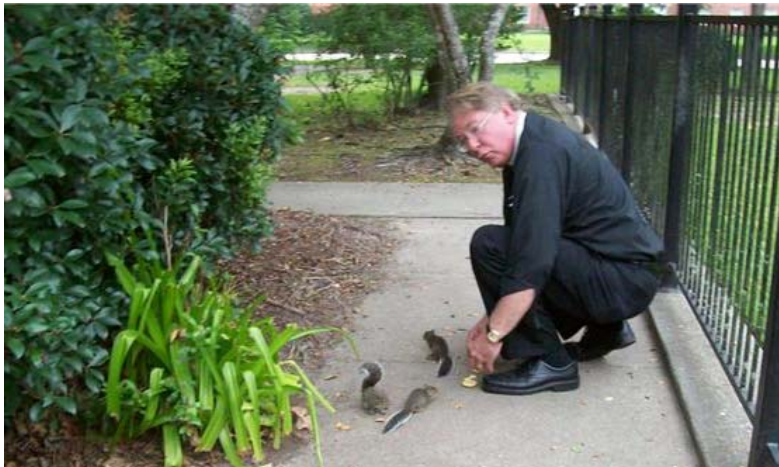
Trinity's own "St. Francis"

Adjournment. The meeting adjourned at 6:30 p.m. after The Lord's Prayer.