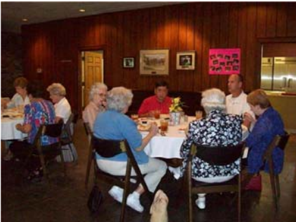
Civitan Camp, 2008

Do you want to know what happened to the sheets members of Trinity donated to Civitan Camp? Take a look at the picture taken by Sally Wilcox on the night of the fish fry and play. Civitan would like to thank Trinity for their support.